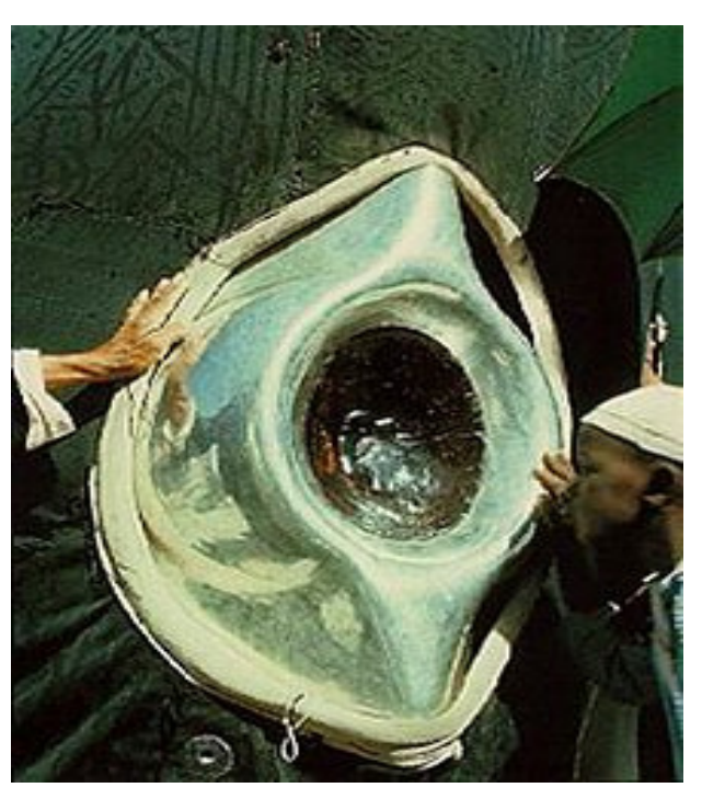
Fig. 2. Worshiping Yamin Allah to the Hadschar al Aswad (black stone). The terminology Yamin Allah is Arabic for the right hand of Allah .

The final word on the matter comes from the renowned Islamic scholar Caesar Farah. "There is no reason, therefore, to accept the idea that Allah passed to the Muslims from the Christians and Jews."