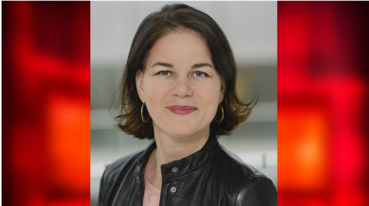
Annalena Baerbock, (B'90/Grüne), born on 15 December 1980 in Hanover.