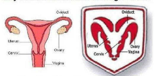
They thought you'd never notice...

Why men are so attracted to Dodge Trucks: