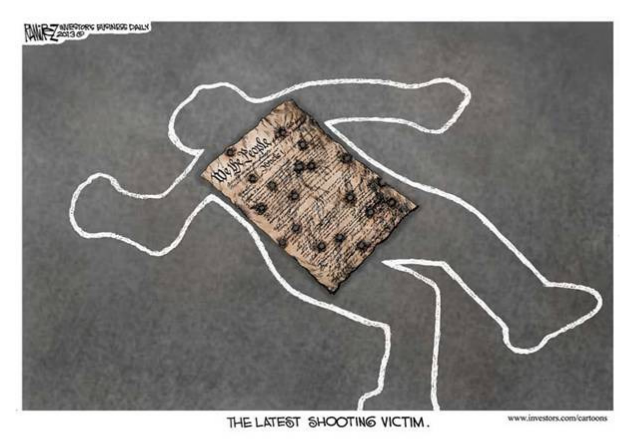
\underline{Source: Ramirez\ via\ \underline{www.investors.com/cartoons}\ at\ \underline{http://www.powerlineblog.com/archives/2013/01/the-latest-shooting-victim-the-constitution.php}