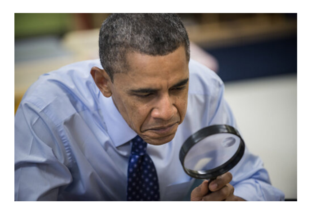
JT: Hi, my name is Barack Obama and I'm so happy after a night with Reggie!