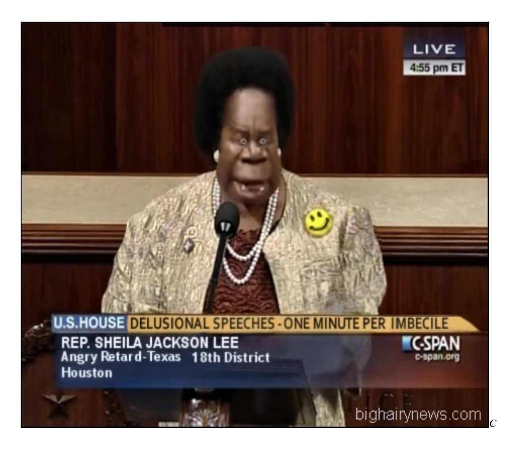
Confirmed brain dead: Texas Rep. Sheila Jackson Lee

JT: She's not the only one in Congress who is brain dead. The Democratic majority in the Senate is brain dead as well.