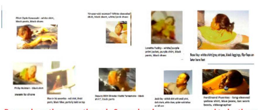
Remember - these are the only 9 people who were supposed to be there.