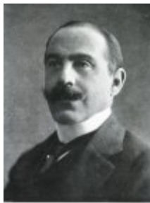
Dr. August Wassermann

“Any Muslim who has Syphilis must not be cured by Salvarsan discovered by a Jew, Dr. Ehrlich. He should not even try to find out whether he has Syphilis, because the Wasserman Test is the discovery of a Jew. If a Muslim suspects that he has Gonorrhoea, he must not seek diagnosis, because he will be using the method of a Jew named Neisser.