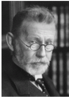
Dr. Paul Ehrlich