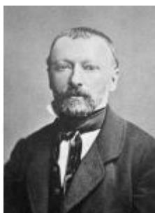
Dr. Ludwig Traube

“A Muslim who has heart disease must not use Digitalis, a discovery by a Jew, Ludwig Traube.