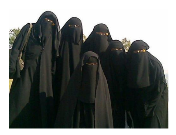
Muslim women wearing the naqab.