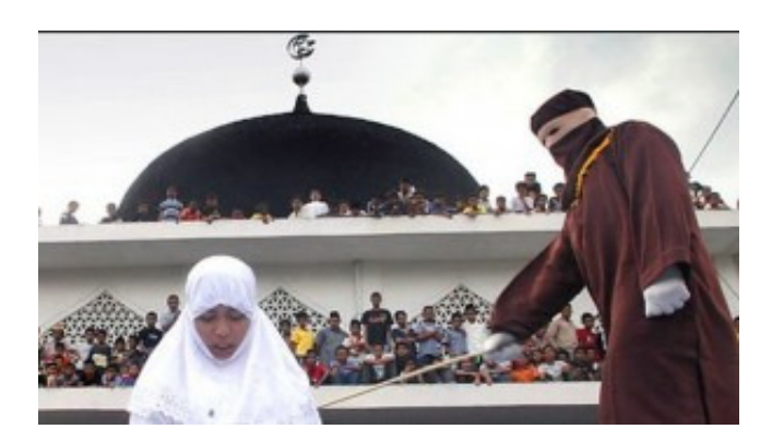
Rape victim receiving 100 lashes for her "crime."

He writes: "I saw a well-equipped invading army indiscriminately killing millions of civilians and raping 200,000 women. Eight million uprooted people walked barefoot to take refuge in a neighboring country. The institution of Islamic leadership supported the invading army actively in capturing and killing freedom fighters and non-Muslims and raping women on a massive scale. Each of 4,000 mosques became the ideological powerhouses of the mass-killers and mass-rapists. And these killers and rapists, these Islamists, were the same people of the same land as the freedom fighters and raped women. That was the civilians of Bangladesh and the killer army of Pakistan in 1971. All the Muslim countries and communities of the world either stood idle or actively sided with the killers and rapists in the name of Islam. The message was clear. Something was very wrong, either with all the Islamic leaders or with Islam itself ." (page 294)