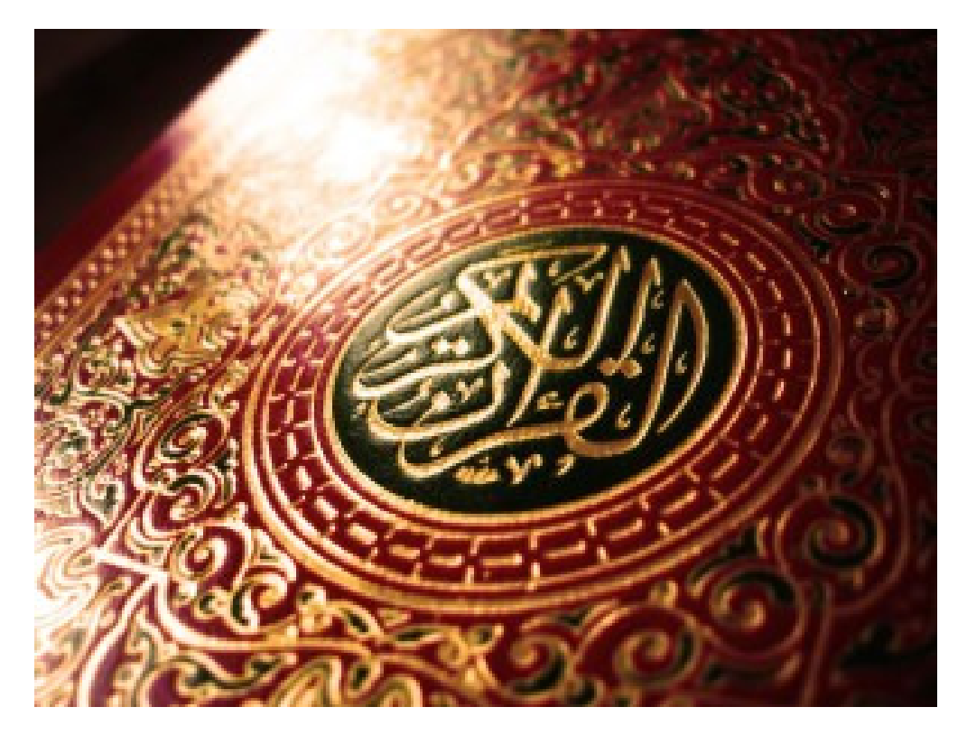
Qur'an Cover

In <u>Bangladesh</u> in 2011, a <u>14 year-old girl, who was sexually assaulted by her 40 year-old</u> <u>cousin, received 100 lashes for her "adulterous" behavior</u>. She did not survive her punishment for being a victim. Over the past decade, several hundred women have been flogged in <u>Bangladesh</u> under similar circumstances.