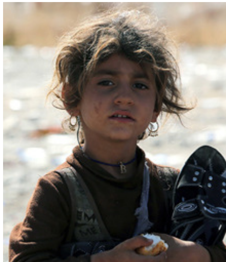
7-Year-Old Executed for 'Cursing Divinity'