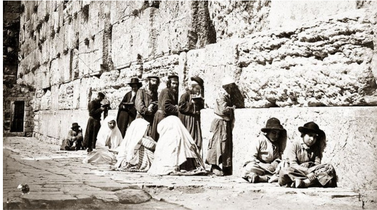
Jews at the Wailing Wall in 1870.