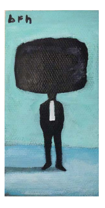
This 2 inch x 4 inch self-portrait, acrylic on canvas, unframed, by BigFurHat was auctioned off. Read more at <a href="http://iowntheworld.com/blog/?p=199015#dEPYG8dSpAbbJWzR.99">http://iowntheworld.com/blog/wp-content/uploads/2013/08/bfhsp.jpg</a>. For the results go to <a href="http://iowntheworld.com/blog/?p=199050">http://iowntheworld.com/blog/?p=199050</a>.

Barack Hussein Obama is a leftist, lying politician, cartoon fool, and con-artist.